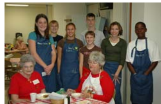
Future Members of San Pedro's 2006 Confirmation Class volunteer to earn service hour credits by serving meals at the church bazaar in November 2005.