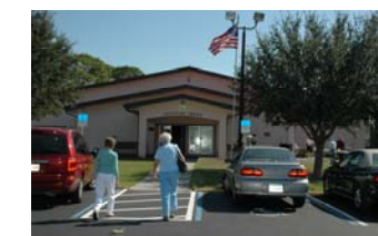
"There are no strangers, only friends we haven't met yet."