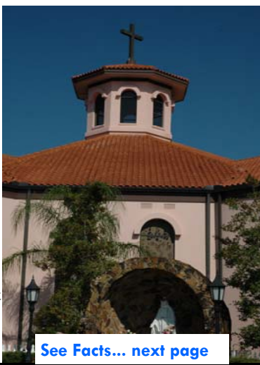
See Facts... next page

I can't tell you how special it is that at the end of every mass, time is taken to